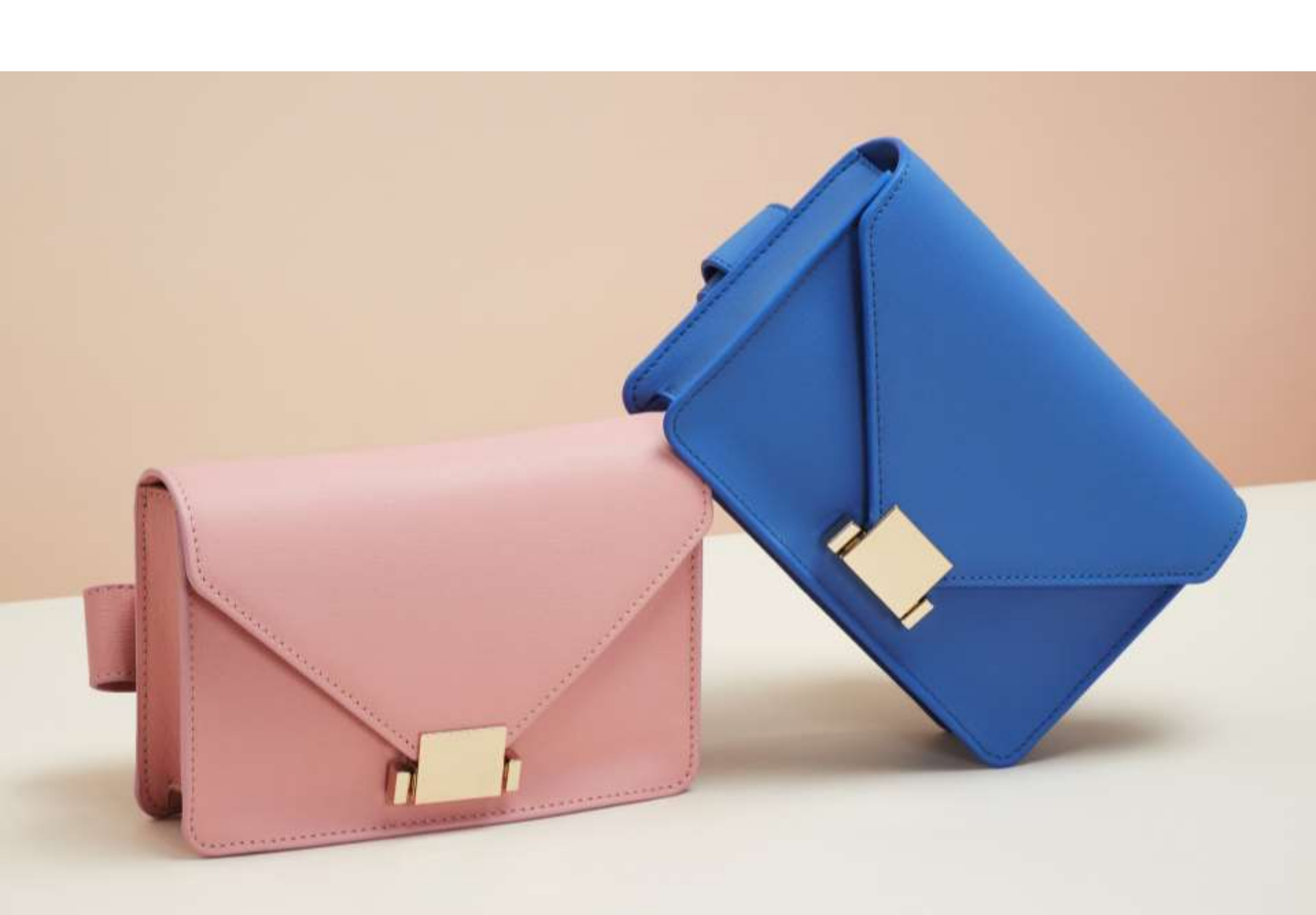
Pink & Blue