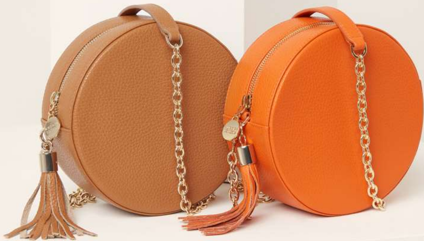
Tan & Orange