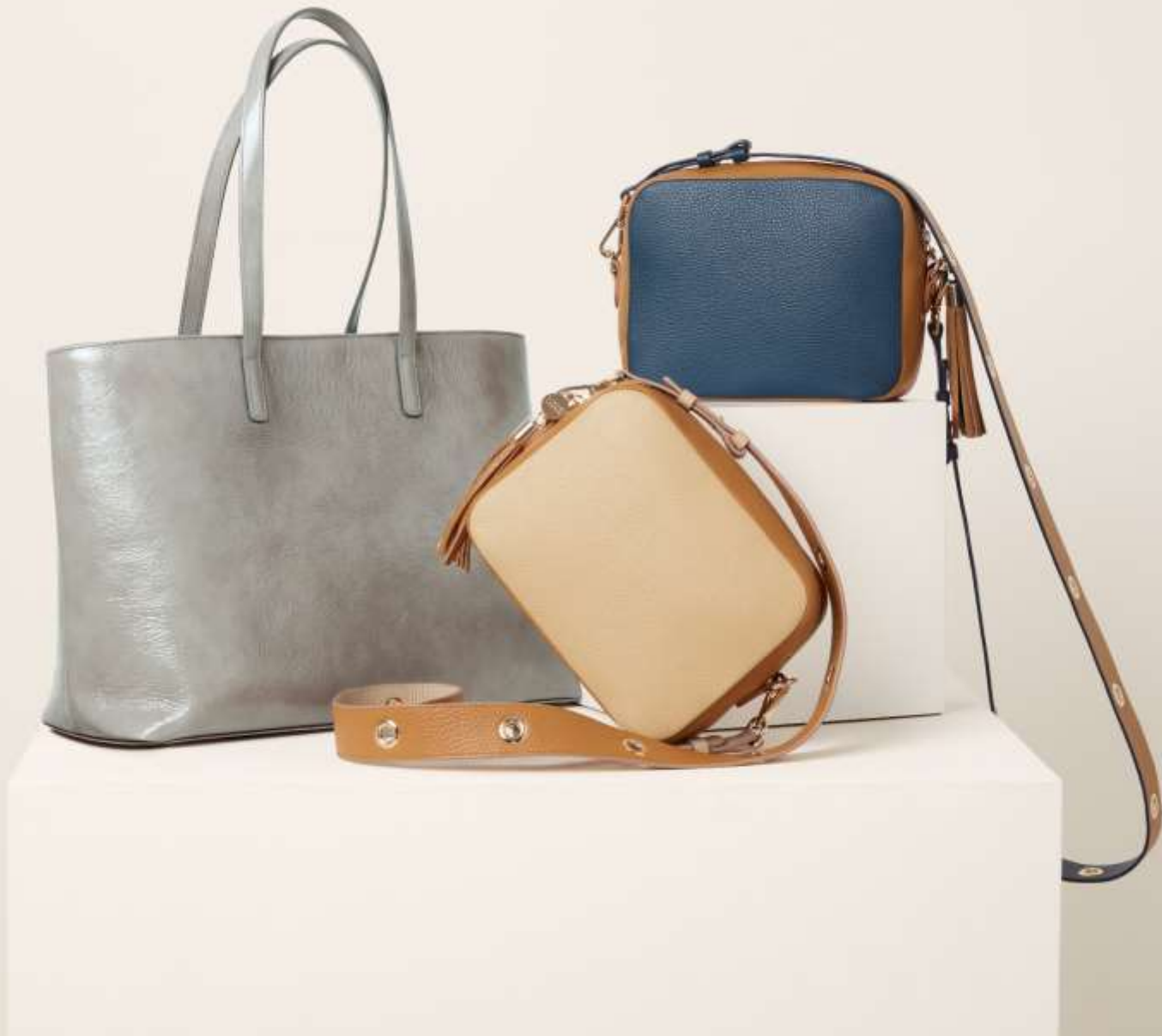
Savannah Patent Tote Grey, Dual Tone Gigis Stray/Navy & Navy/Tan